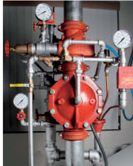
DV-5 Pre-Action Valve

Use guidelines per NFPA13-2007 7.9 System Requirements for Refrigerated Spaces