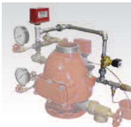
QRS Electronic Accelerator