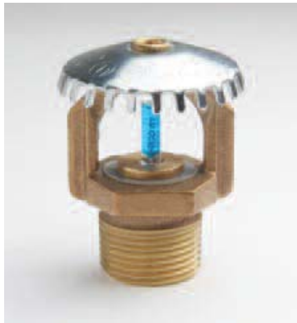
Ultra K 17 141°C Sprinkler