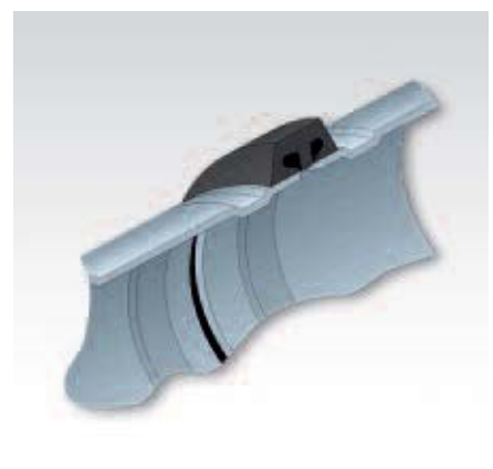
Tri-Sealed Grooved Gasket